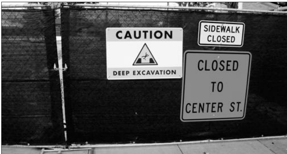
ALLIE CAMP Senior Photographer

"We pay tons of money to go to school here, so they should try to