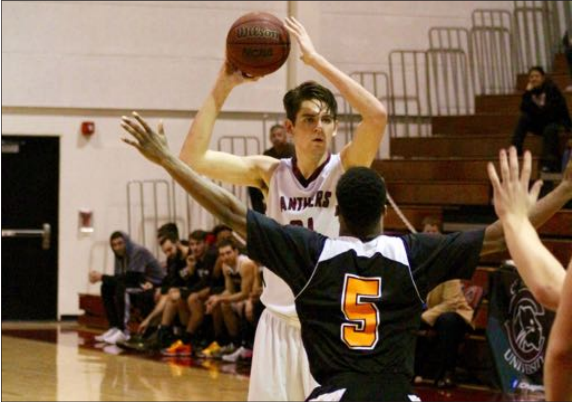
ALLIE CAMP Senior Photographer