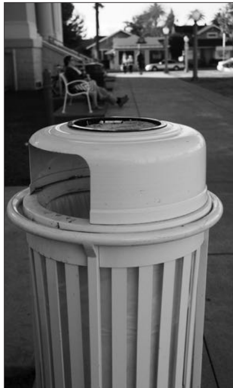
Smoking is prohibited on Chapman's campus as of Feb. 1.

To understand if the campus community was in favor of this change, student government sent a survey to students to understand if they were in favor of a smoke-free campus. About 10 percent of the student body