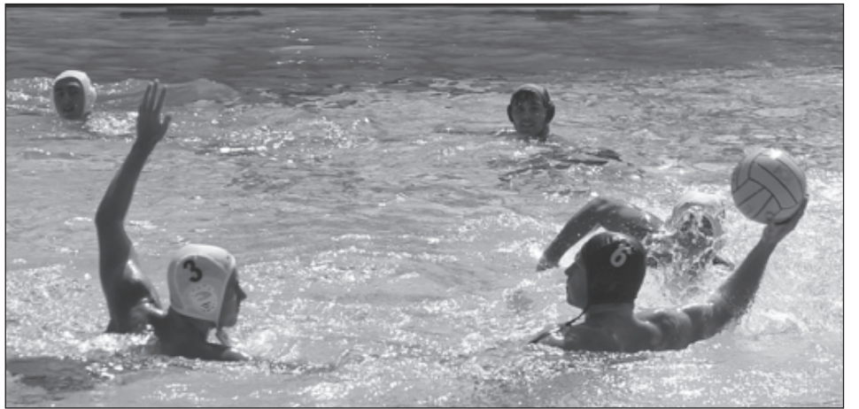
The men's water polo team practices in preparation for its first game Sept. 2.

Christopher Newport University, and a first-ever victory in the NCAA Division-III tournament. Chapman did graduate nine seniors, however, most of whom were starters. Despite the large graduating class, Chapman returns a core of seven seniors and will look to maintain a similar level of success as last season.