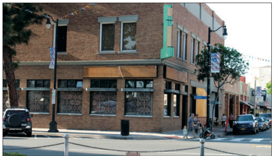
JACKIE COHEN Photo Editor

External scenes for "American Horror Story" were filmed in the Orange Plaza in June.