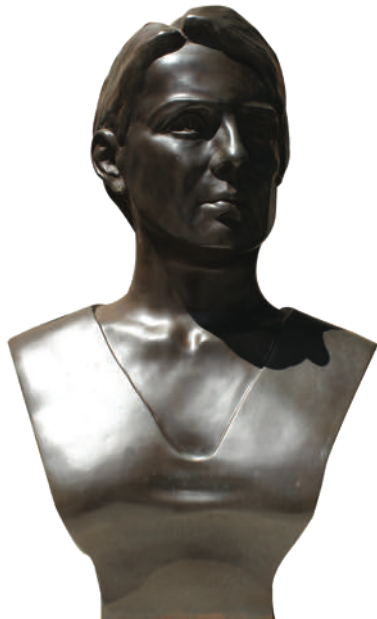
Gift of friends of Vernon L. Smith

"I take a lot of issue with celebrating him, just because of his reaction to the AIDS crisis,"