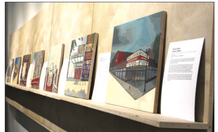
One of the two galleries at 1888 Center. This one displays paintings of famous bookstores, such as The Last Bookstore in Los Angeles and Powell's Books in Portland.

Del Mundo emphasized that this is not a "take your cup and