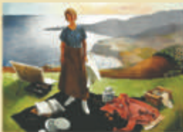
CALIFORNIA SCENE PAINTINGS