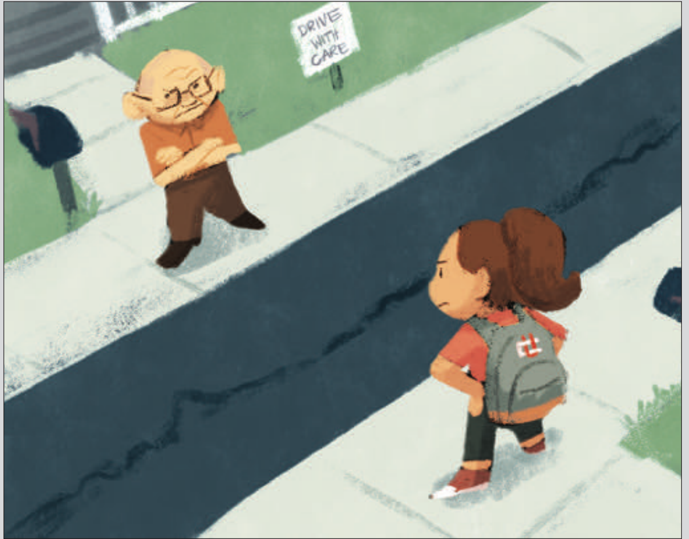
Illustrated by Gaby Fatone